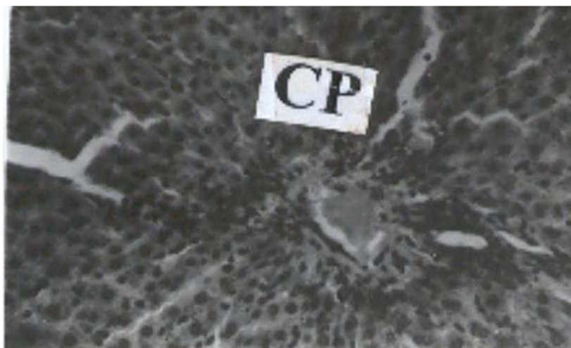
Plate 3c: Liver section of a rat given 38 mg/kg body weight \text{AlCl}_3 for fourteen days showing severe cellular proliferation (CP) at the portal tract. (H and E stain x 400).