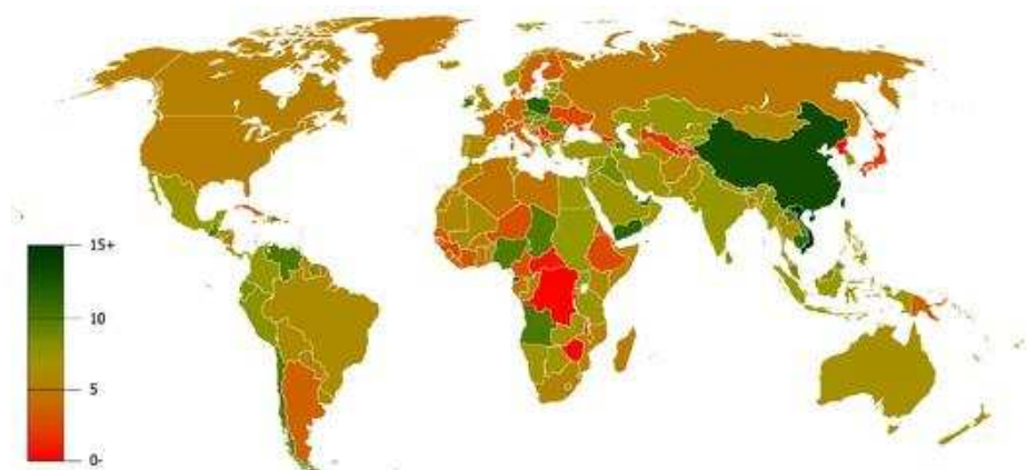
A world map of GDP growth (annualized), from 1990 to 2007.

Below is a global representation of the economic changes recorded in the years 1990-2007.