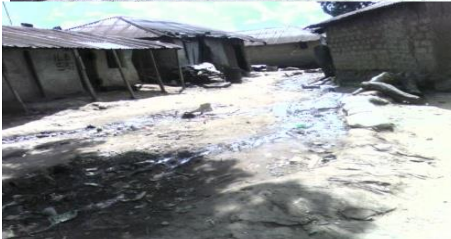
Lugbe, a fast growing slum near Abuja