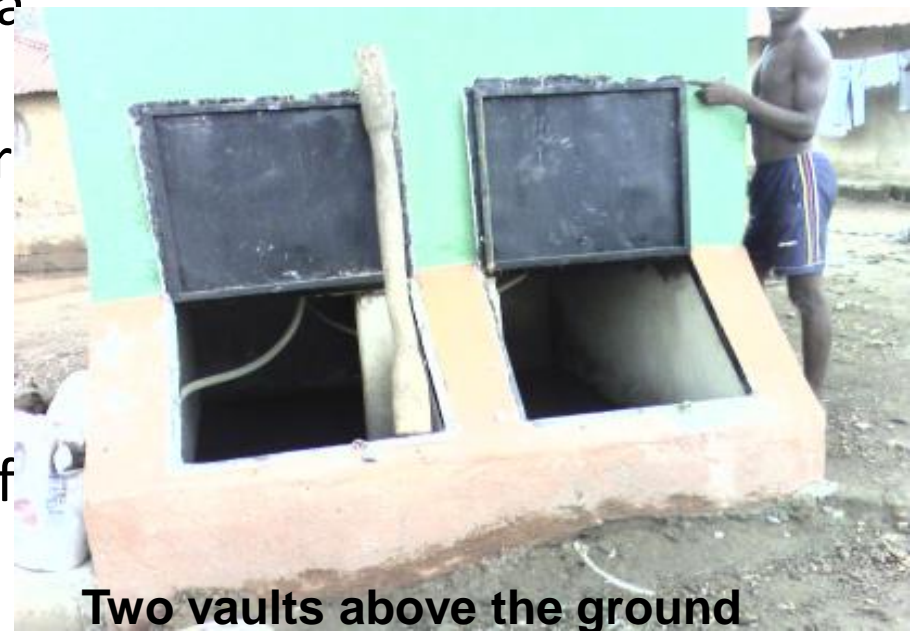
Two vaults above the ground