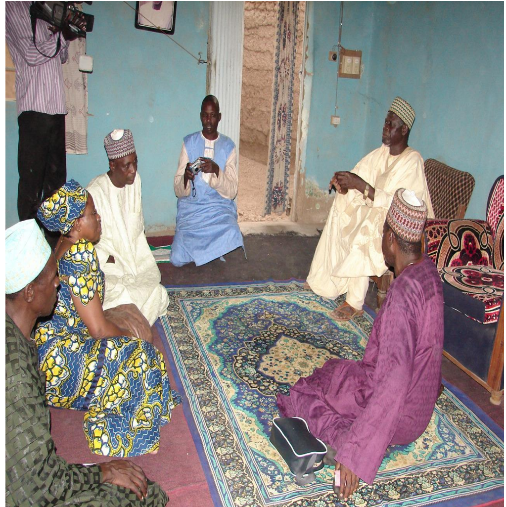
Special advocacy visit to the Chief