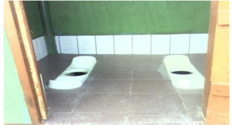
Urine diverting squatting pan